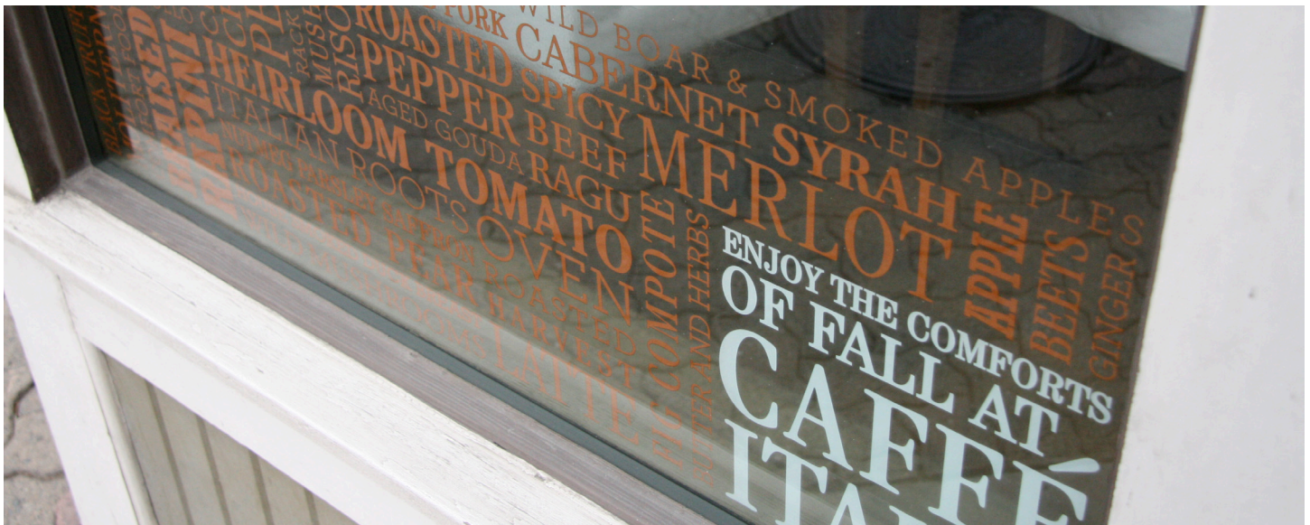
Print Sugo Italian Food & Wine Seasonal Exterior Graphic