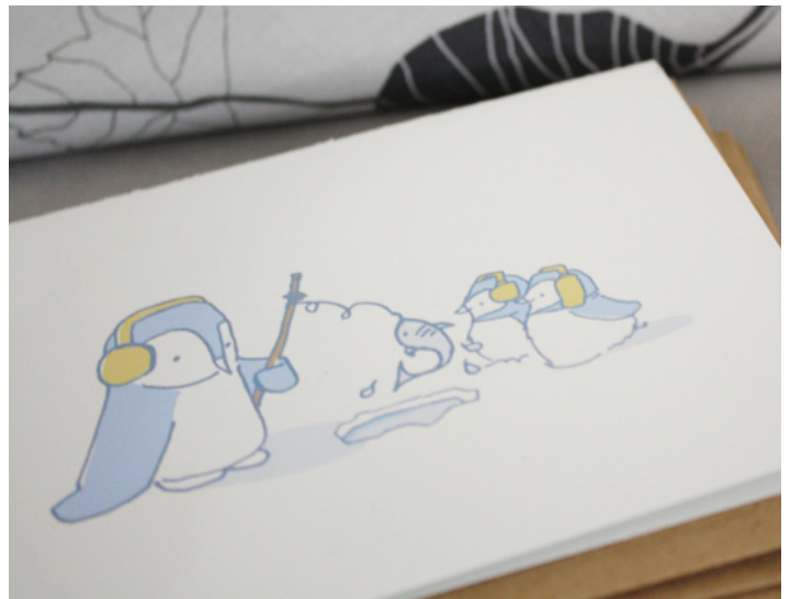
Illustration Custom Holiday Greeting cards.

Illustration: Jenny Chan Studio: Freelance